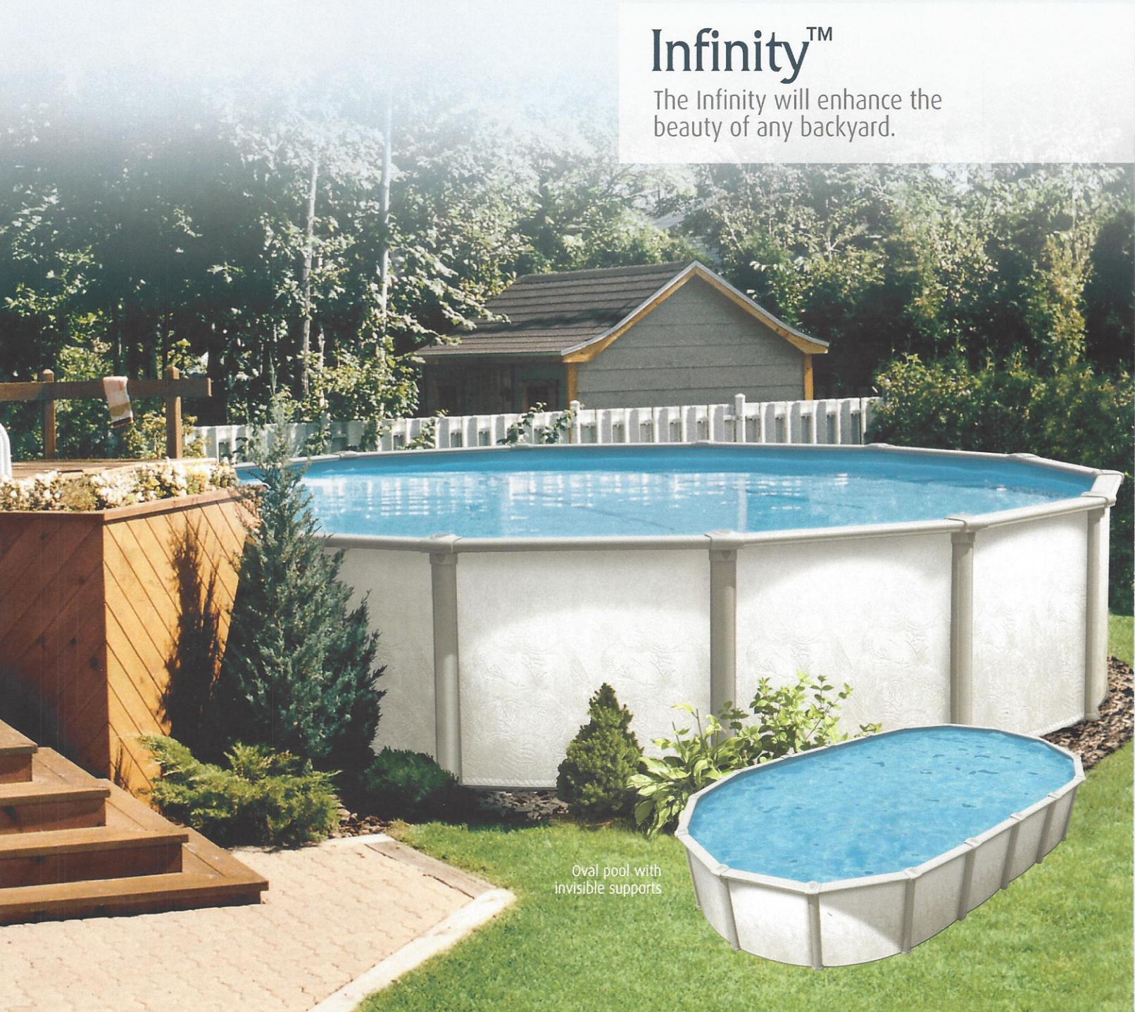
Oval pool with invisible supports

The Infinity will enhance the beauty of any backyard.